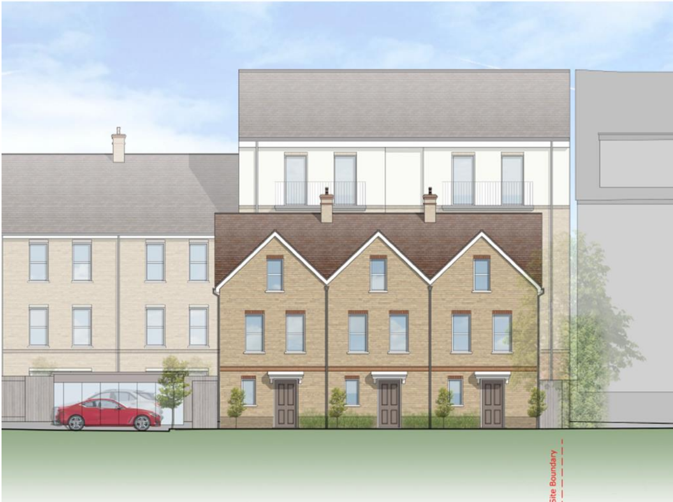
Front elevation – Terrace 2 (D) with rear of (A) & (B) behind