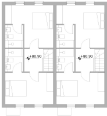
Second Floor Plan – Townhouses (B)