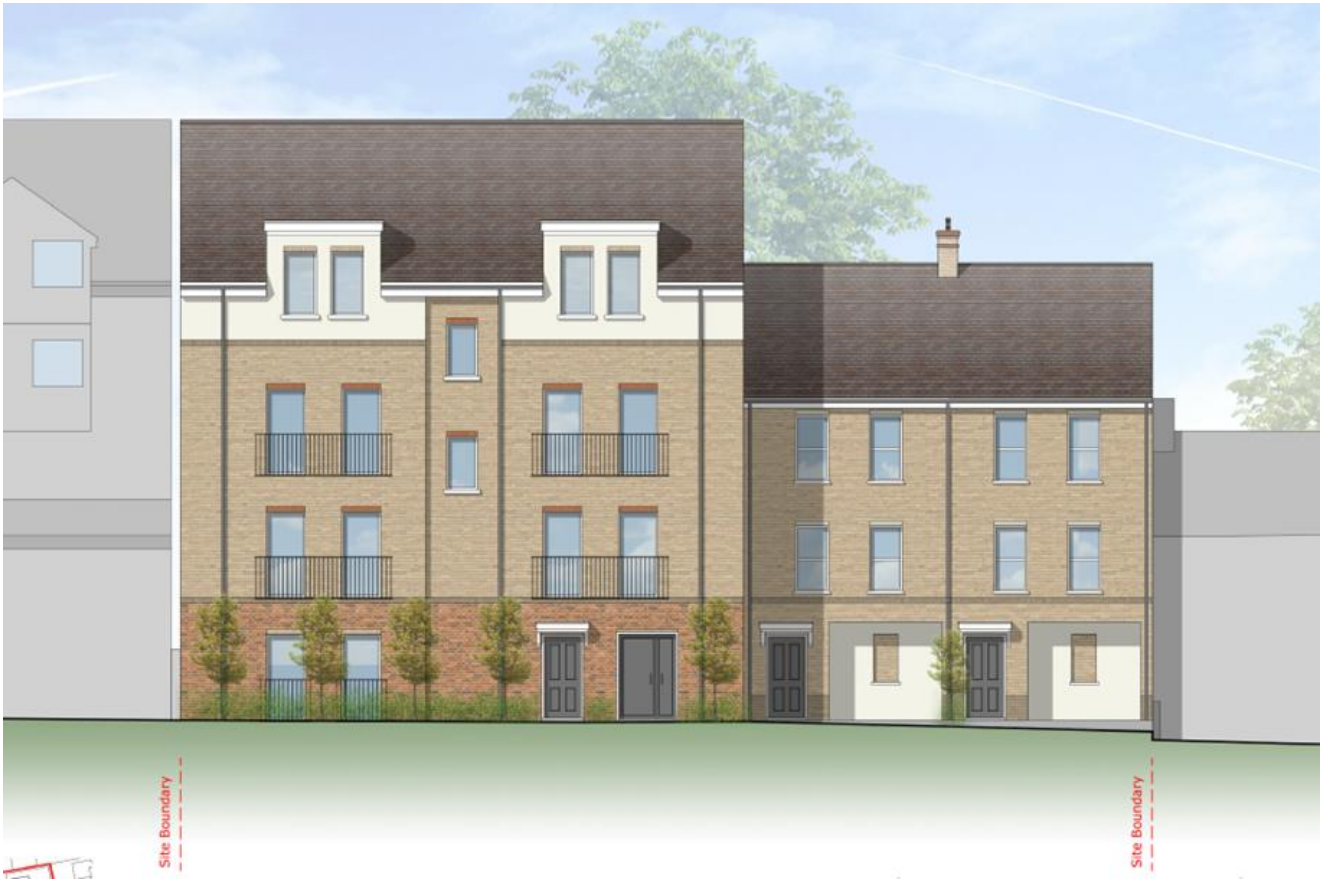
Front elevation – Lynchford Road (A & B)