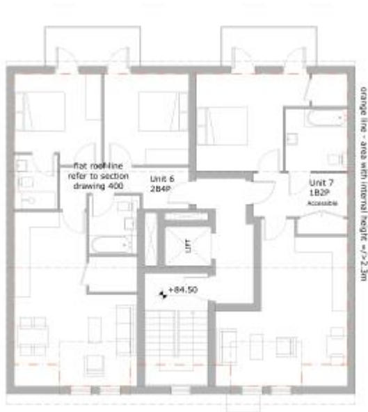
Third floor plans – Apartment Building (A)