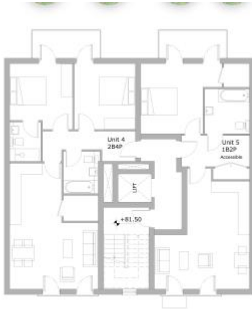
Second floor plans – Apartment Building (A)