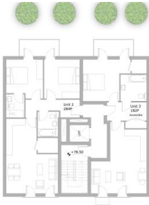
First floor plans – Apartment Building (A)