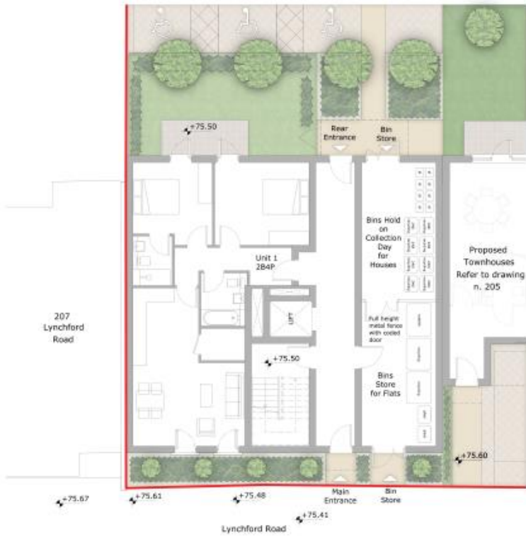
Ground floor plans – Apartment Building (A)