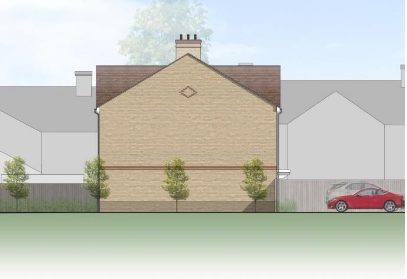
Side elevation – Terrace 1 (C) (looking south towards rear of Lynchford Rd properties)