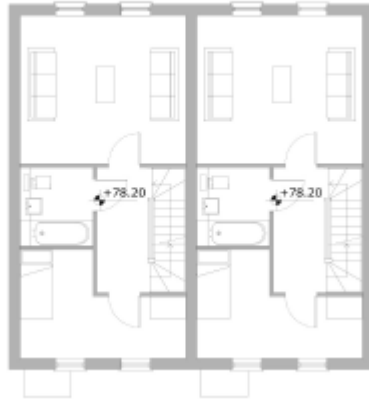
First Floor Plan – Townhouses (B).