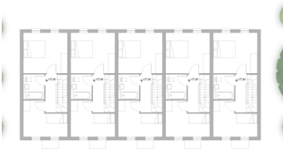
Ground and first floor plans – Terrace 1 (C). This is the same layout at houses in Terrace 2 (D)