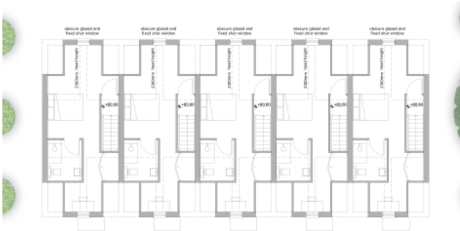
Second Floor Plan – Terrace 1 (C).