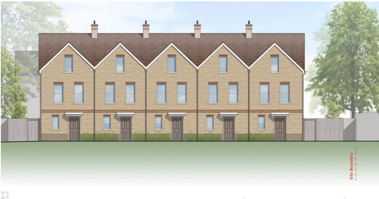
Front elevation – Terrace 1 (C)